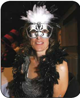
The Ball was an amazing success, with many creatively costumed attendees.

Next year, we'll do it all again. Save the date: Sat., Oct. 26th. 🐾