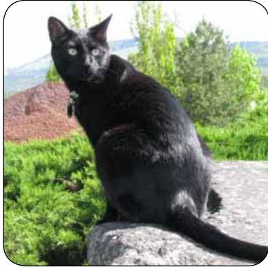
Panther continues to keep watch for visitors while basking in the sunshine at his new home in Salem.

I used a collar and leash, but realized pretty quickly that they were not needed. Panther would obey my voice commands. We walked twice a day and 'talked' about a lot of things."