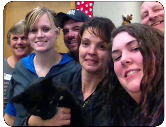
The Shelter staff celebrated with Panther on his day of adoption in December.

FOTAS remains our most important partner and its role in Shelter operations continues to expand. The awesome FOTAS Board of Directors, staff, and volunteers all stepped up to help with the