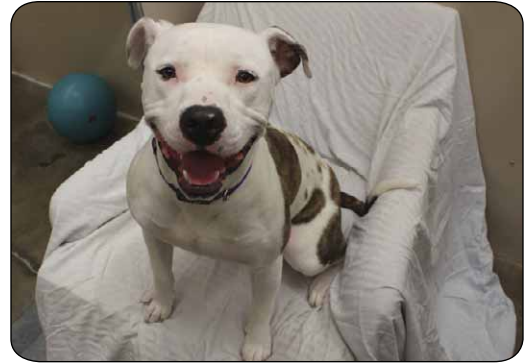
Easy chairs were placed in the kennels to create a more comfortable space for the dogs. Benny, pictured here, shows his approval.