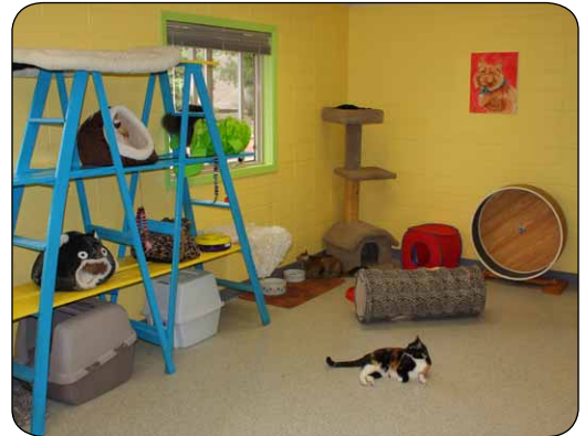
One of the cat rooms at the Shelter was recently transformed into a free-roaming space after Shelter staff attended a national conference on animal behavior. This space has quickly become a favorite hangout for cats and people alike.