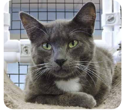
Puck fully recovered from ringworm and found a forever home.

The bad news is that FOTAS needs some help paying for this new facility. Although some of the materials and labor were donated, we still need approximately $3,000 to pay off the building, and would greatly appreciate anything you can contribute to help pay for this on-going off-site recovery center! Please write “PUCK'S PLACE” on your check's memo line, or donate on-line at fotas.org .