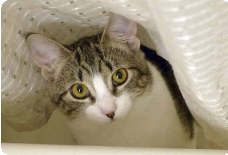
Gizmo came in injured; went out purring!