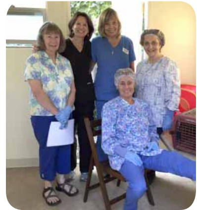
Generous FOTAS volunteers made Puck's Place come to life, and then nursed Puck (and others) back to adoptable status.