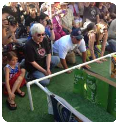
Race "parents" line up to entice their dogs down the race track.

speedy little guy/gal in this wonderfully somewhat competitive event, although you will need to pre-register at Rogue Valley Pet in Medford, or before the races at Howiee's. In addition to this being a fun-and-friend raiser, it's also a fundraiser for FOTAS. We'll be selling drawing tickets for wonderful prizes donated by Howiee's and others, and adorable Chi Race t-shirts and bags. And, of course, we'll never turn down donations (big or small!).