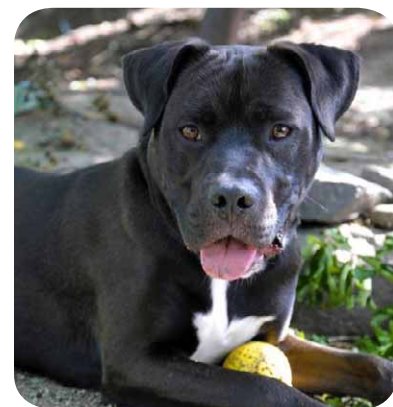
Link is so very grateful for his second chance for love.

After spending five months at the Shelter in 2014, including two months in foster care, Link – a handsome and sweet boy – finally got adopted by a young family with kids. After a year and half, they lost their apartment and unfortunately the landlord would not allow Link to stay in their new place. So he ended up back at the Shelter through no fault of his own.