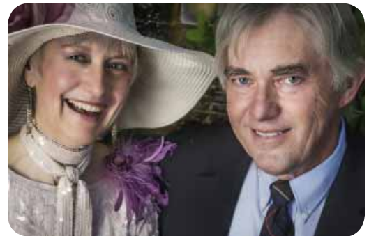
A good time was had by all of our generous guests in 2015.