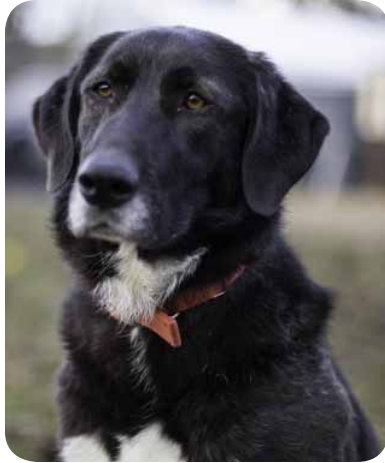
Violet loves her new big city life.