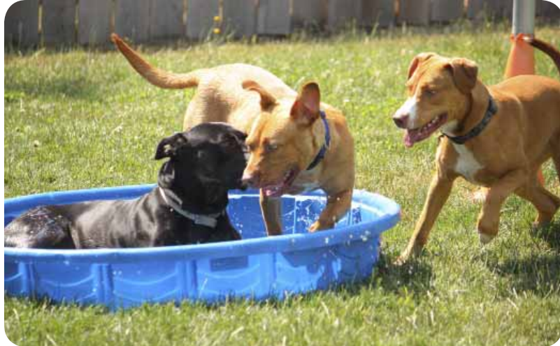
Adoptable dogs having a blast in the Shelter agility yard during a Playing for Life supervised session.

With kittens, you're never sure what their personality will be like when they grow up. With cats, 1 year and older, you know! The Shelter gets wonderful "previously-loved" cats ... and they linger at the Shelter longer, waiting for YOU to come and adopt them!