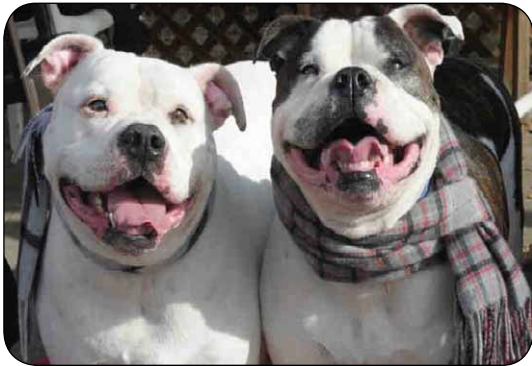
Little Bit and Panda Bear

In November 2015, a large American bulldog named Little Bit entered the Shelter with her sister Panda Bear, because their owner could no longer care for them. Both are 7 years old, and very sweet and affectionate, but did not do well with other dogs. Little Bit was overweight and had a very