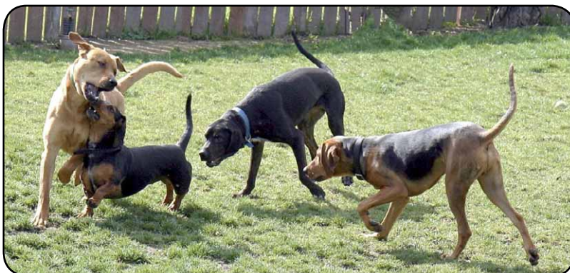
Dogs being dogs during a morning Play Group romp