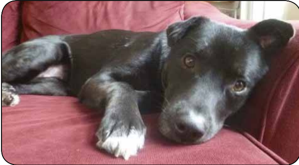
Olive recovers in a FOTAS foster home

On a dark evening in November 2015, as the staff was closing down the Shelter, a truck pulled into the parking lot. A farmer from Gold Hill had an injured black Labrador retriever mix in the back of his truck, which he had found lying in his field, unable to walk. They called Best Friends Animal Hospital in Talent, which reopened to examine the dog. They found puncture wounds on her two back legs, plus a shattered elbow. What could have happened to her? Attacked by another animal? Hit by a car? Even with lots of poking and prodding, this dog remained amazingly calm, as if she knew she was safe.