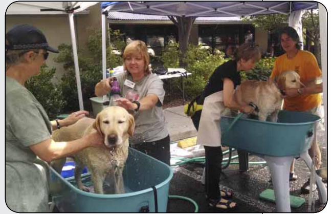
Dirty dogs are scrubbed clean by FOTAS volunteers at the Ashland Food Co-op.