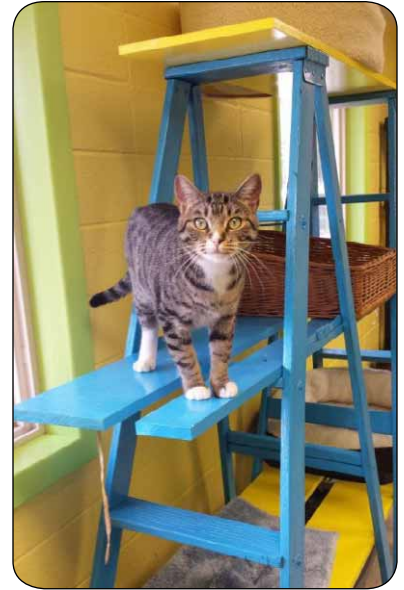
The free-roaming space at Whiskerville is a big hit with the cats at the Shelter.

One Saturday in late spring, a dedicated group of two staff members, a cat room volunteer, and two dog walkers rolled up their sleeves and got to work. All kennels were removed in Cat Room C, thus starting the transformation. Bright green and yellow paint, along with some pictures and decals on the walls, and mobiles hanging from the ceiling, formed the backdrop for what was to come: cat trees for climbing and hiding, big cushy pillows where kitties can stretch out, and shelving units for the dedicated feline loungers. A ladder arrangement was painted bright blue and connected in such a