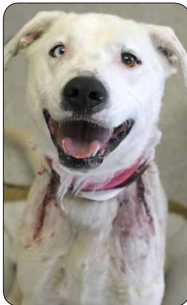
Lucky was badly injured when he was brought to the Shelter, but still had a big goofy grin on his face.

“The veterinarian said she would be able to close the wound in spite of its depth and length, which literally extended from one side of his neck across the top, all the way to the other side.”