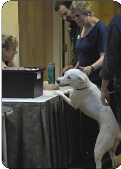
Lucky (Ace) pauses to register for the Paws to Celebrate event.

recovering from surgery, I brought him home to foster him for the rest of the healing process. He looked frightful with two drains on either side of his neck and a huge pressure bandage around his