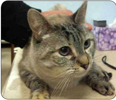
FOTAS volunteers showed that love heals all wounds, both emotional and physical.

LEXI In April 2015, Lexi entered the Shelter as a stray Lynx point cat in a trap. She had runny eyes, was flea infested, and her front paws had been declawed. She also limped and appeared to be in pain, which we found out was from two breaks in a leg that had not healed well.