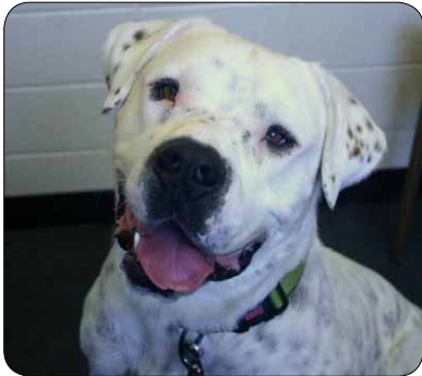
Gus is proof that "there's no place like home."

GUS (now CASH) In May 2014, a 100 lb., 4-year-old American Bulldog/Mastiff mix, arrived at the Shelter as a stray. We named him Gus, and he was quickly adopted, but returned, then adopted again in July, but returned as a stray a year later in July 2015. He was adopted once more, but returned yet again. Seems Gus doesn't like kids or cats, but does like to get out of the yard!