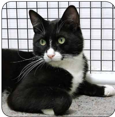
Rocky took his time finding the right home ... with a FOTAS volunteer.

ROCKY Regal Rocky, a 3-year-old Tuxedo, waited patiently at the Shelter for almost three months, hoping for a new home. He is a friendly and funny boy; we took countless photos of him; posted videos; he was a Fabulous Featured Feline, and we talked him up all the time — to no avail.