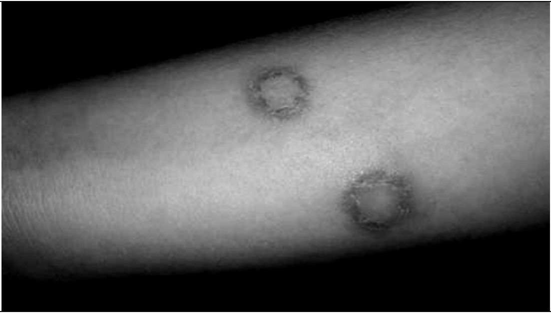
Ringworm – Human skin (can appear anywhere on the body)