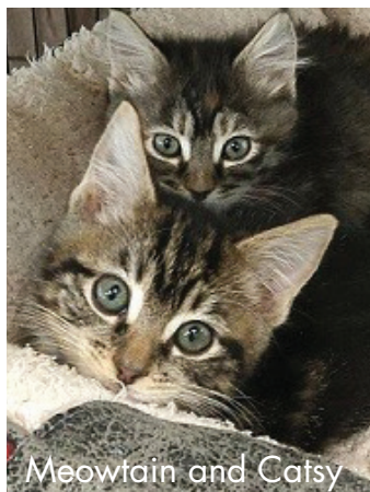
Meowtain and Catsy