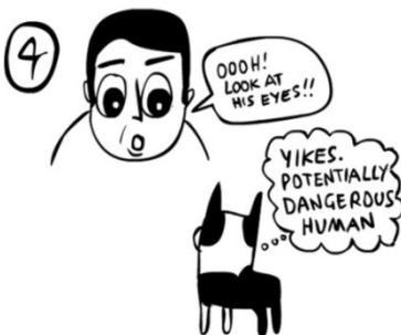
4 DON'T Stare him in the eye (This is an adversarial gesture)