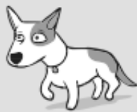
Moving in Slow Motion walking slow on floor