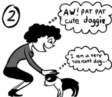
2 DON'T Lean over the dog & stick your hand on top of his head