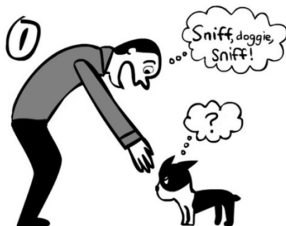
1 DON'T Lean over the dog & stick your hand in his face

Most people do this stuff and it stresses dogs out so they BITE! I don't care how cute you (or your kid) think Boogie is. Please show him some respect.