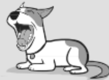
Acting Sleepy or Yawning when they shouldn't be tired