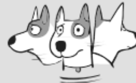
Hypervigilant looking in many directions