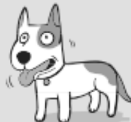
Panting when not hot or thirsty