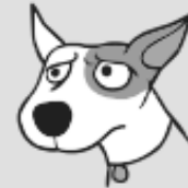
Brows Furrowed, Ears to Side