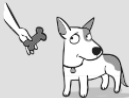
Suddenly Won't Eat but was hungry earlier