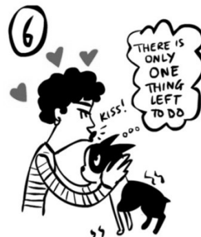
6 DON'T Grab his head and kiss it (This is an invasion of space)

Doing this to a dog who doesn't know you is like a perfect stranger giving you a great big hug and kiss in an elevator. Wouldn't that creep you out? And wouldn't you have the right to defend yourself?