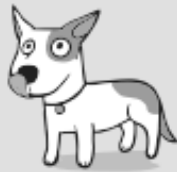
Licking Lips when no food nearby