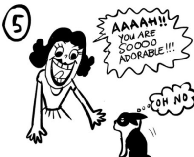
5 DON'T Squeal or shout in his face