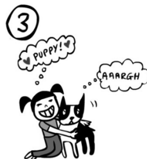
3 DON'T Grab or Hug him