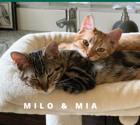
MILO & MIA