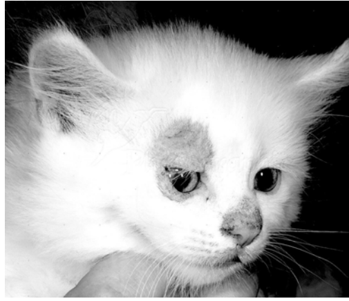
Ringworm – Cats/Kittens (can appear anywhere on the body)