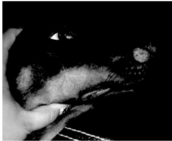
Ringworm – Dogs/Puppies (can appear anywhere on the body)